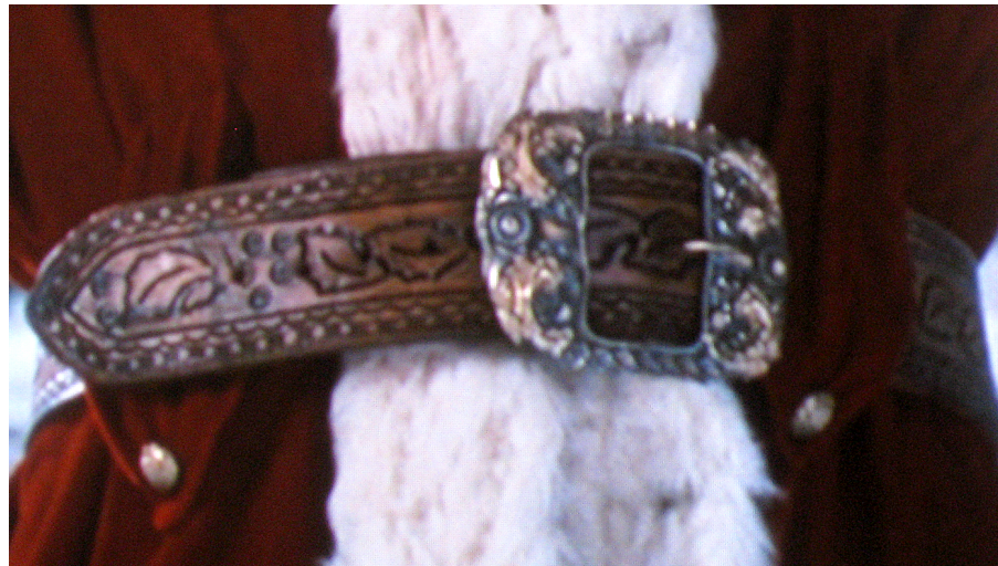
Original Inspiration Belt

Stamping of holly should approximate this look, though without the color, this belt is to be all black. (sample courtesy of Tandy)